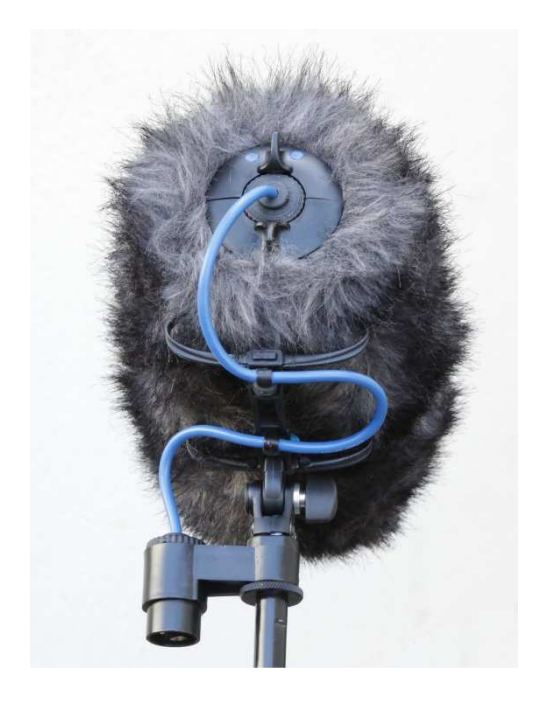
LONG CABLE Long & Xtra Long cage

When inserting the microphone (installed in the mike holder) into the windshield, the cable has to be untwisted first. It has to look like the following pictures : (That's the S of COSI logo !!!)