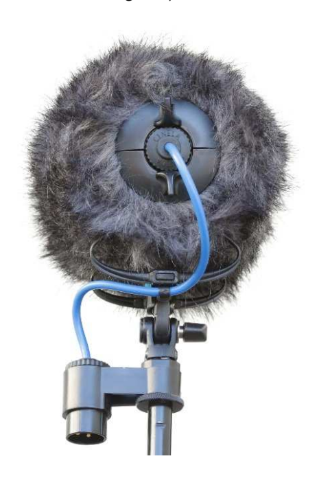
SHORT CABLE Xtra Short, Short & Medium cage